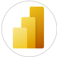
Power BI Business analytics