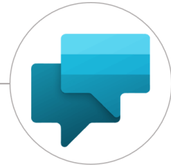
Power Virtual Agents Intelligent virtual agents

During this fully funded session, we'll work collaboratively with you to understand the current state of the business, identify challenges and opportunities for improvement. We'll engage with key stakeholders to create high priority transformation scenarios to either grow revenue, save cost, increase productivity or mitigate risk using the Power Platform.